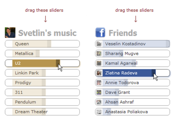
Figure 1. The control phase of item control (left) and friend control (right) conditions.