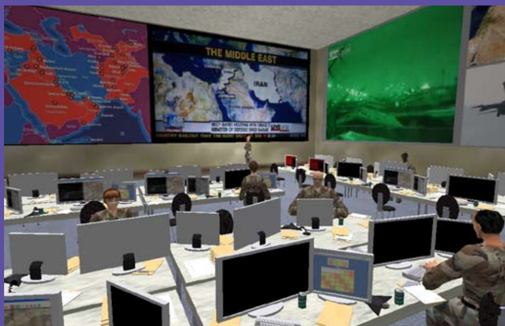
Figure 1: Screenshot from DECENT project virtual world.

The recent emergence of cloud computing is forcing the nature of computation to evolve. For example, users no longer run computations on private machines or machines of which they even have physical awareness. The same evolution has taken place for data storage: many users no longer keep data, such as email, on their machines, but rather allow “the cloud” to maintain and safeguard that data. This transformation has allowed ubiquitous access to computation and data with higher availability and reliability than possible with personal machines and local servers. It has also allowed us, in principle, to dispense with certain (at times, severe) limitations of traditional computing, due