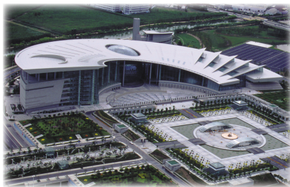
Shanghai Science and Technology Museum

The objective of the Far East Experience Track is to demonstrate the state-of-the-practice of software engineering in Far East Asia by reporting on various experiences and establishing a dialogue between practitioners and researchers on the benefits, obstacles, and weaknesses of applying software engineering principles, techniques, methods, processes, and tools in an industrial or organizational setting for a variety of applications. Submissions may be case studies that describe the application of a software engineering technique, tool, or process in an industrial or organizational setting; experience reports that describe the history of a software project accompanied by a critical review of experience with the software during one or more development phases; and experimental reports that describe experiments which systematically control the influencing factors and result in quantitative data about some aspect of software development.