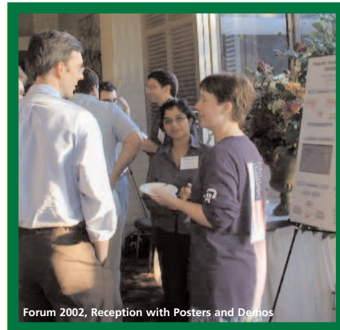
Forum 2002, Reception with Posters and Demos

If last year's Forum is a reasonable measure, the poster and demo session following the conference presentations will be a big hit with attendees—and not only because of the great food and drink provided. The posters and demos will cover a wide variety of sub-